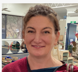
Blossom- Casual Teacher